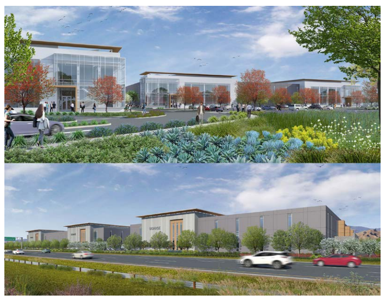
Axiom Point will be developed in two phases: Phase 1 two buildings totaling 251,531 SF – delivering Summer 2024 and Phase 2 one building totaling 138,500 SF – delivery TBD

Peter Conte, National Director 415 713-1114