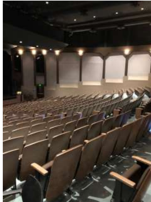
AFTER - VAPT House Interior