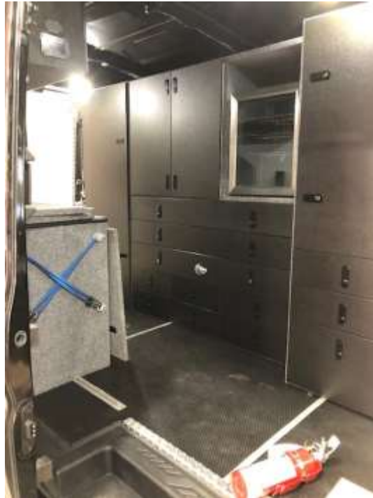
Evidence Van Up-fit