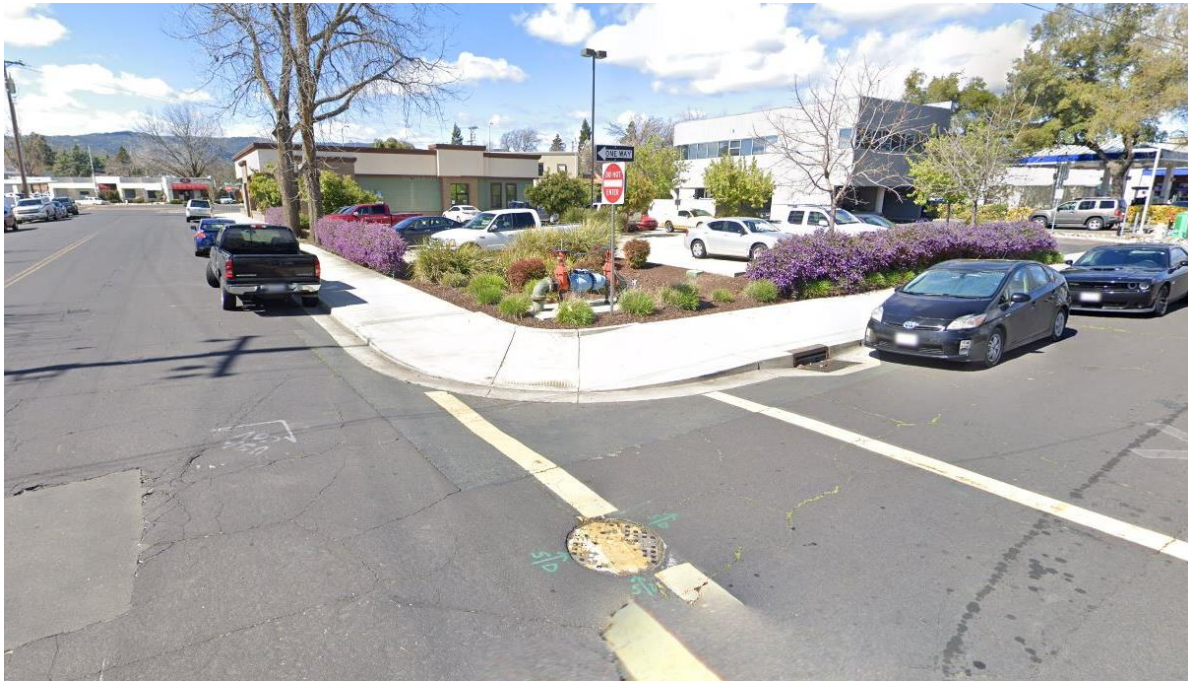
Location 2 – Southwest corner