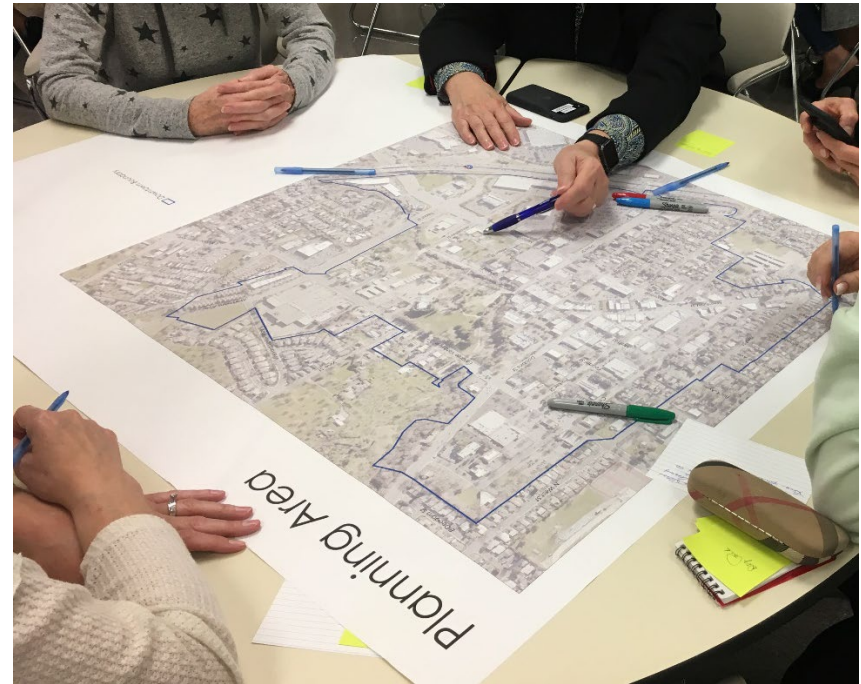
Input provided during a community charrette