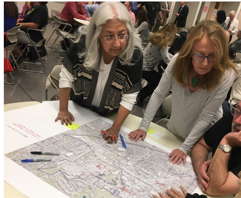
Various DTSP outreach events