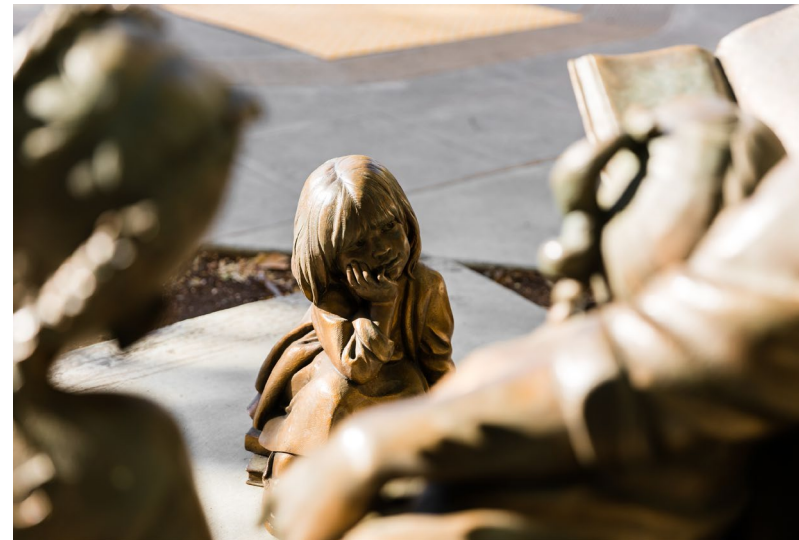
Statue by the Vacaville Town Square Library