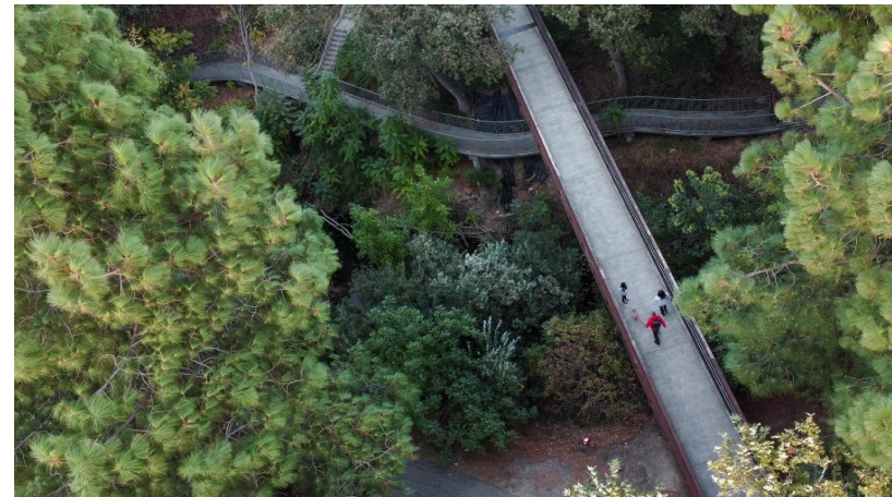
Andrews Park bridge connecting to the Town Square Library

A specific plan is a detailed planning document for a defined geographic region. State law requires every city in California to have a general plan, which establishes development and conservation goals, as well as the locations and intensity of different land uses in the city and its plan area. A specific plan implements the goals and policies of the general plan for a smaller geographic area, often establishing more detailed standards that go beyond what the general plan's land use designation or underlying zoning would normally regulate.