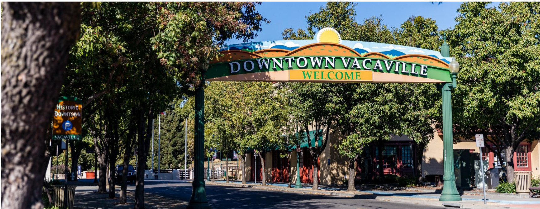
Downtown Vacaville gateway sign spanning Davis Street, near Catherine Street

The Vacaville Downtown Specific Plan serves as a guide to inspire the continued growth and evolution of Vacaville’s Downtown core. It draws upon the ideas and values of the city’s residents, business owners, elected officials, staff, and other stakeholders to advance a shared vision for Downtown.