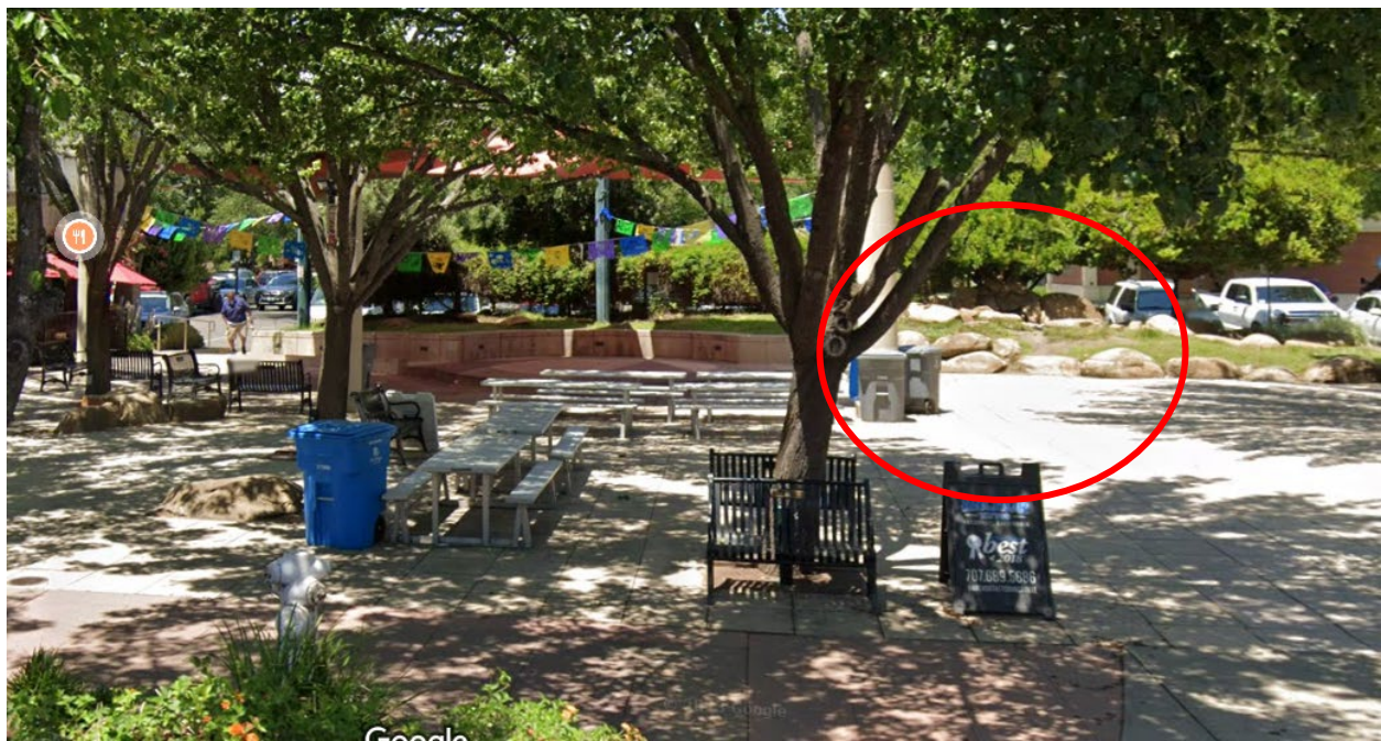
*Circled area is the approximate location that is proposed.