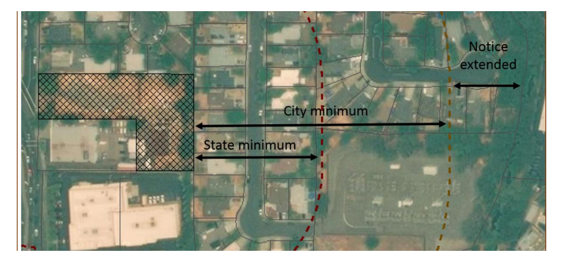
Figure 1: Example of extended notice radius

Staff will regularly review notice formats for clarity and plain language.