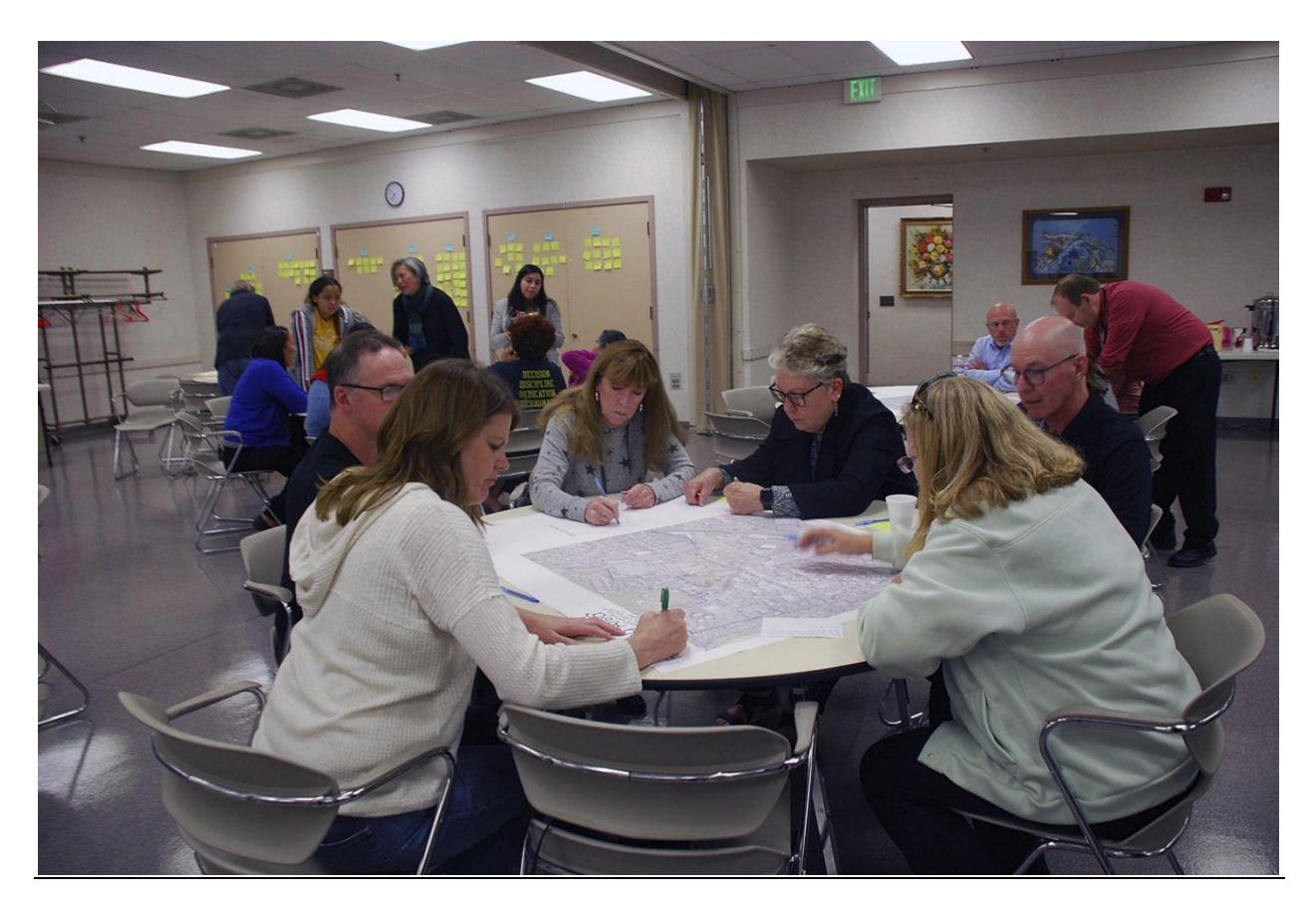
Figure 3: Community Meeting