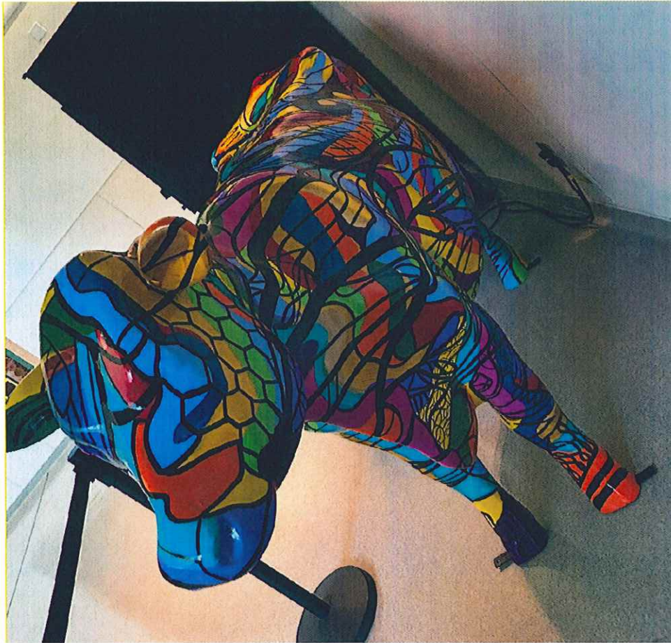
Attachment 1: Photos of the cow sculpture being donated to the City of Vacaville