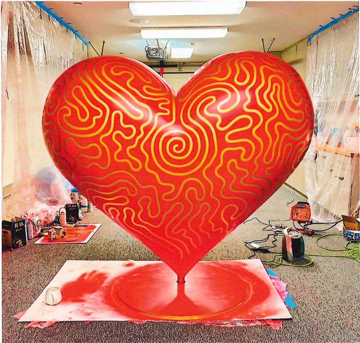
FRONT SIDE OF HEART