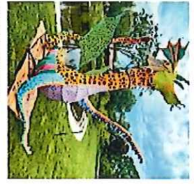
7 CULTURAL ART INSTALLATION