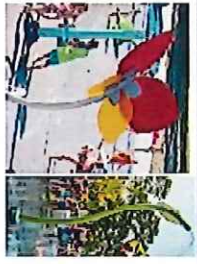
4 NEW ART STATION AND BIODIVERSITY ATTRACTIONS