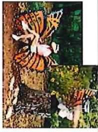
3 ENHANCED BIOPARC WITH SENSORY BOARD