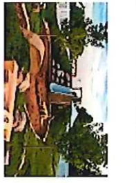
5 NEW NATURAL SCIENCE AREA