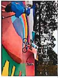
2 NEW RECREATION SCULPTURE ELEMENTS