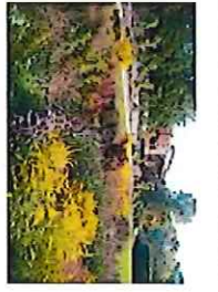
6 SOLAR LIGHTS AND BENCHES WITH NATIVE PLANTS