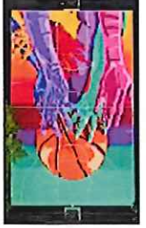
1 ARTFUL RECREATION OCCUPATION COURT